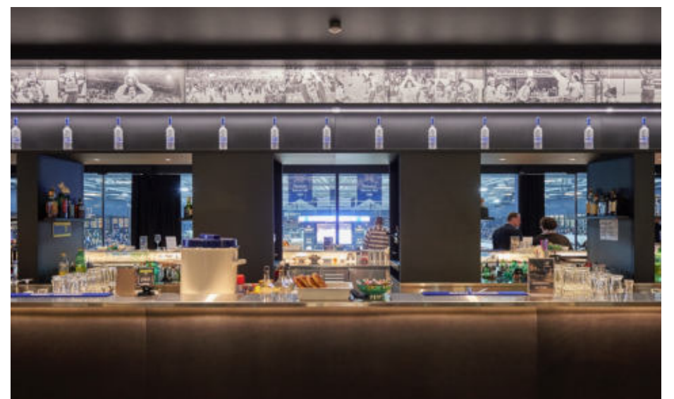
Bar "Amag Lounge"