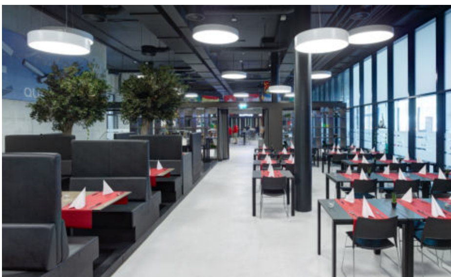
Restaurant "Il Capitano"